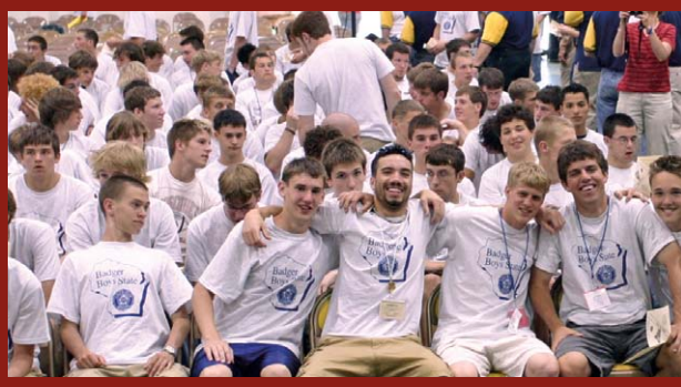
Participants at American Legion Boys State programs develop friendships that will last a lifetime.